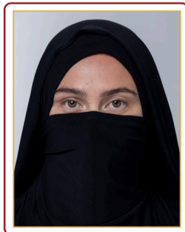
Face partly covered