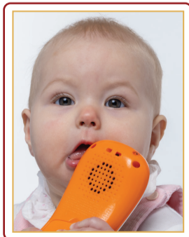
Object in the photo